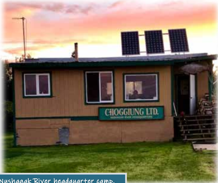
Nushagak River headquarter camp.