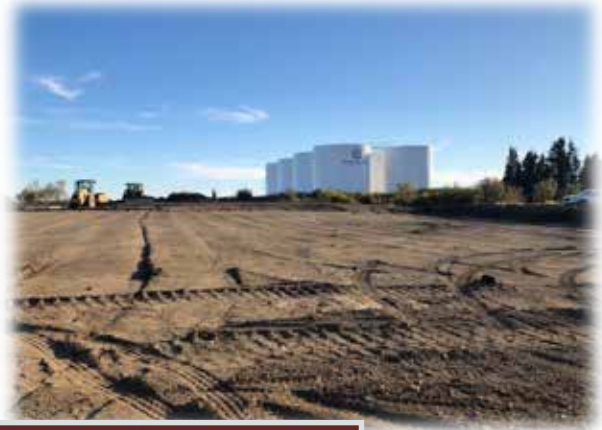
Bristol Alliance Fuels' gravel pad construction.

Bristol Construction Services had a busy season at the Snake Lake rock quarry and have completed the rock sales for the village of Mekoryuk. They continue to develop and produce rock products for local and out of region customers.