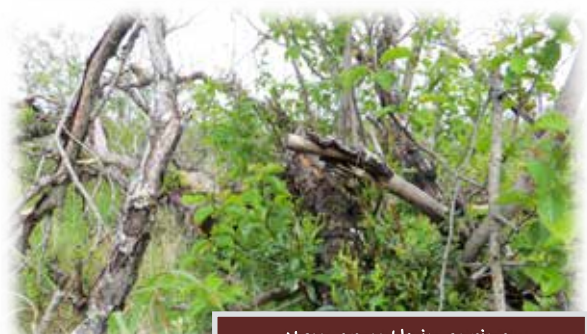
New growth in spring.

Phase two of the conservation contract with the U.S. Department of Agriculture Natural Resources Conservation Service to perform Early Successional Habitat Development and Management is scheduled to take place in late winter, weather permitting. We will begin accepting applications for contract workers for this project in the coming months.