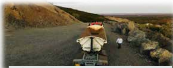
Hauling from the Snake Lake rock quarry.

Bristol Construction Services had a busy season at the Snake Lake rock quarry and have completed the rock sales for the village of Mekoryuk. They continue to develop and produce rock products for local and out of region customers.