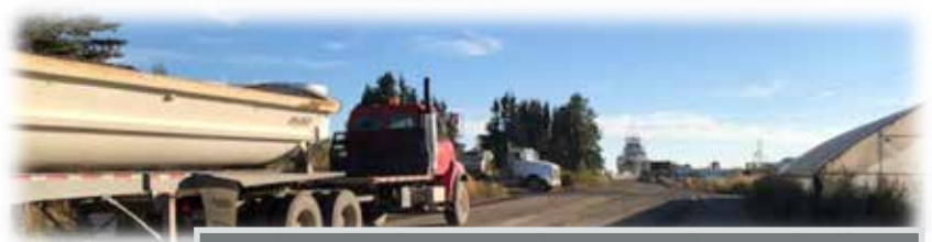
Gravel haul to Bristol Alliance Fuels' gravel pad.