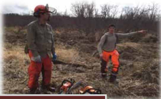
Enhancement crew, early spring 2018

Another season of the Land Use Program has concluded safely and successfully. We saw an increase in activity on the Nushagak River this summer, making our presence on the river more crucial than ever in our efforts to protect our land. Our patrol agents act as monitors and play an important role in keeping land use in check. This summer we added a small cabin to our Nushagak River headquarter camp; although the cabins are basic, they offer comfortable shelter and are available for rent.