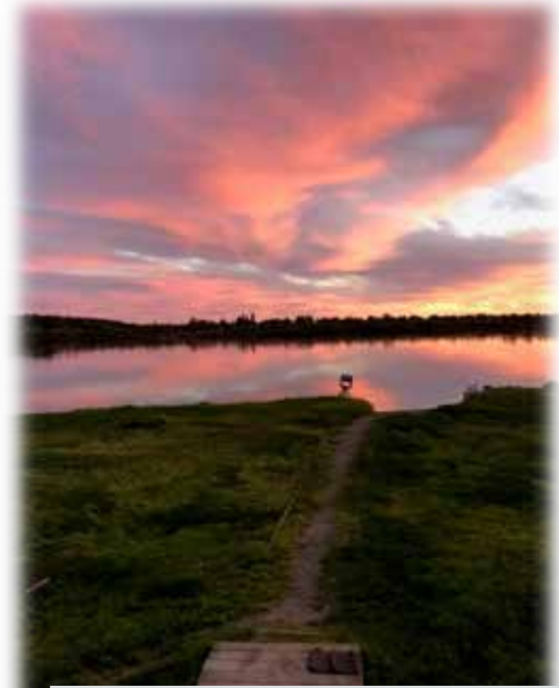
Nushagak River sunrise, summer 2018

Another season of the Land Use Program has concluded safely and successfully. We saw an increase in activity on the Nushagak River this summer, making our presence on the river more crucial than ever in our efforts to protect our land. Our patrol agents act as monitors and play an important role in keeping land use in check. This summer we added a small cabin to our Nushagak River headquarter camp; although the cabins are basic, they offer comfortable shelter and are available for rent.