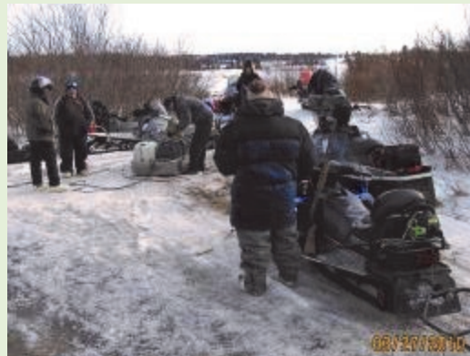
The wood cutting crew (left) prepare to leave Dillingham for Portage Creek. They are looking forward to the next phase of the project which is scheduled for early spring.

With the next project to begin in spring of 2011, willows will be cut in several more designated areas totaling over 125 acres.