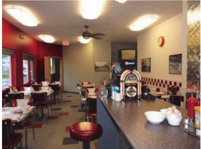
The Bayside Diner opened in May, just in time for the busy summer season. The diner serves breakfast, lunch and dinner, 7 days a week.

CIC, which conducts business in commercial office leasing, residential apartment rentals, and storage rentals. As the sole owner of Quvaq, LLC dba The Bristol Inn and Bayside Diner, CIC also provides administrative support and maintenance for the hotel and restaurant.