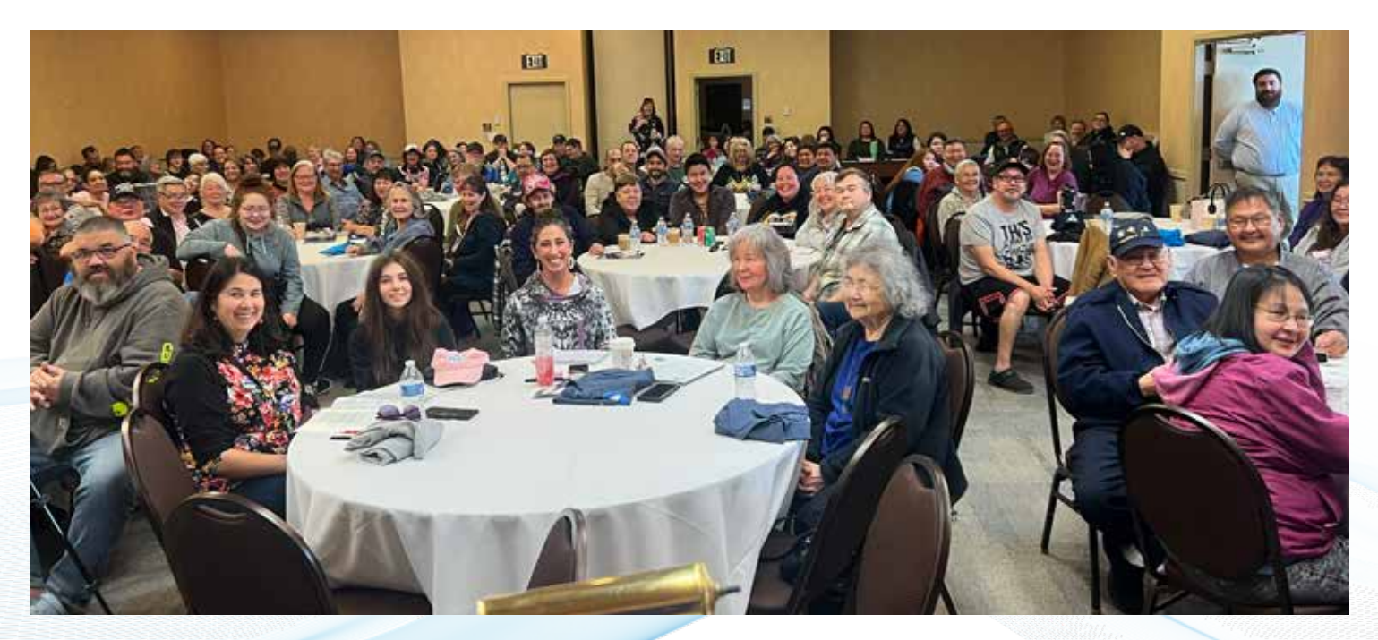
Shareholders at the 50th Annual Meeting of shareholders in Anchorage, Alaska.

Despite the challenges, we have continued to see balance sheet growth- with total assets increasing to over $100 million as of the end of September and shareholder equity attributable to Choggiung growing to nearly $37 million. Choggiung and our subsidiary businesses are well positioned for a strong finish to this fiscal year, and to continue our path of growth and success into the future!